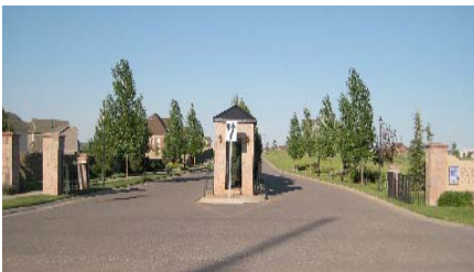
Above: The “faux” gate at the Castlewood Estates subdivision entrance...just one idea for sprucing up our entryway. Got ideas on how to improve our entrance? Let a board member know your thoughts!